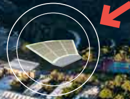
The Mount Carmel Amphitheater